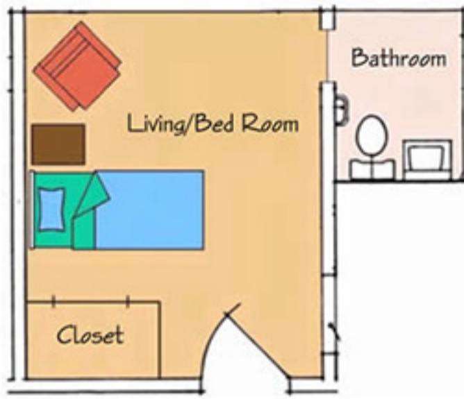
"Studio" Unit (Single)