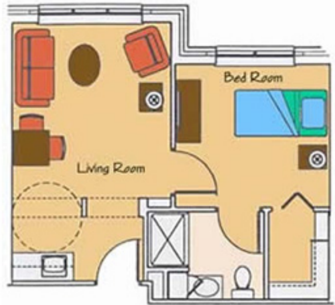
"A" Unit (Single)