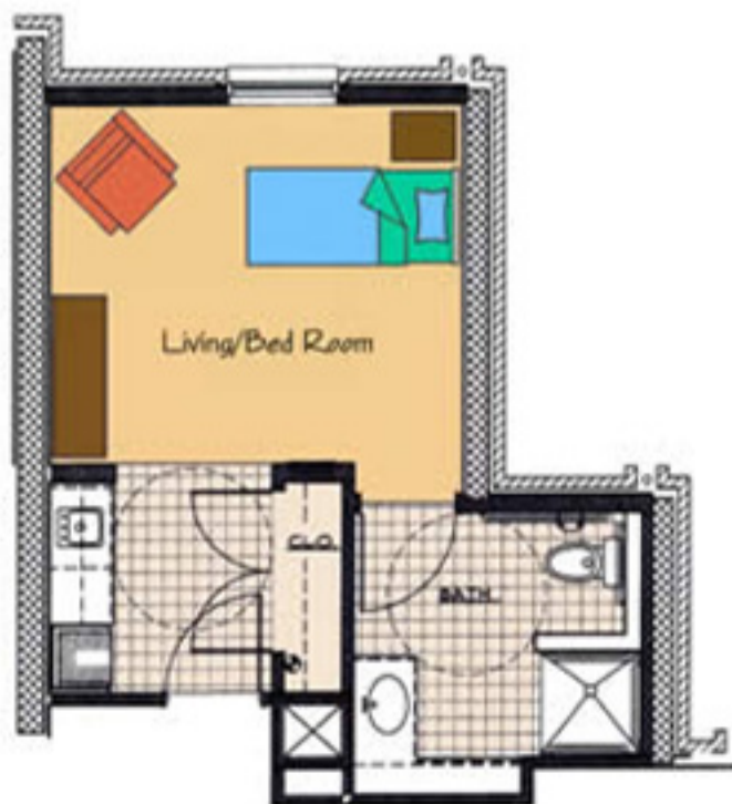
"D" Unit (Single)