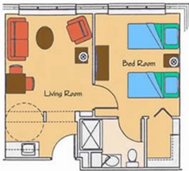
"B" Unit (Single/Double)